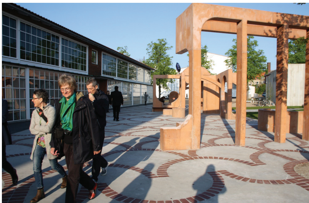
Your Success is Your Amnesia

We look forward to welcoming you to Conference on Literacy 2019 at Efterslægten, and we hope you will enjoy some productive days at our school.